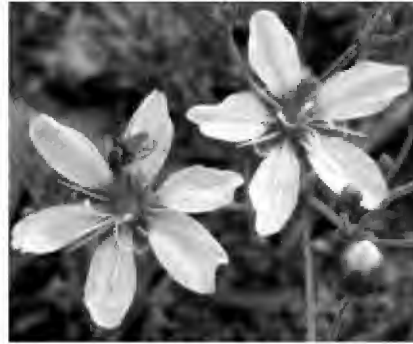
Figure 8. Pine barrens sandwort ( Minuartia caroliniana ) at Napeague.

der and dozens of blooms of sea pink (Figure 11), including a few white ones. Wild indigo (new for me) and bear oak grew in the drier stands of oak at the edges of the marsh.